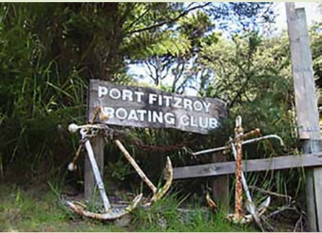
Submerge yourself into Aotea culture.

The port has seen exports of gold, trees, fish, livestock and now mussels, and it's a short trip by boat or land to the cultural centre of Aotea: Motairehe Whanga or Katherine Bay. Here you can be welcomed at two marae which are the pride and joy of mana whenua.