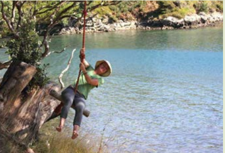
Rope swing, Motu Kaikoura.