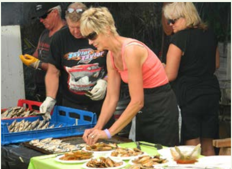
Mussel Fest at Port FitzRoy - legendary!

Chow down, as much as you like, while listening to totally authentic music from near and far and browse stalls of local produce and handicrafts.