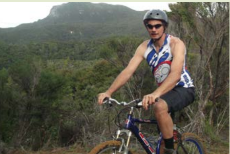
Cycling the Forest Road.

2 hours by bike, 4-5 hours walking (one way).