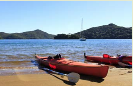
The sheltered harbour is ideal for kayak trips.

The beautiful birds were made redundant when the first telegraph cable was laid to Barrier in 1908. Apparently the cable was more reliable.