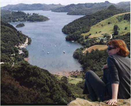
Lookout Rock, a worthwhile side trip off Old Lady Track.