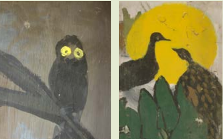
Local wildlife features in the school bus stops on the island.