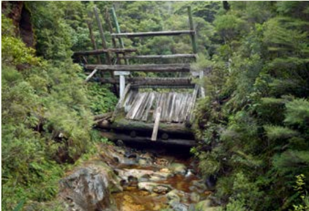
The large kauri dam in this photo was competely destroyed in a 2014 storm and will not be rebuilt.

7 hours loop from the Kaiaraara Bay car park. Walking up the Kaiaraara Track to the the summit of Hirakimata will take about 3-4 hours one way.