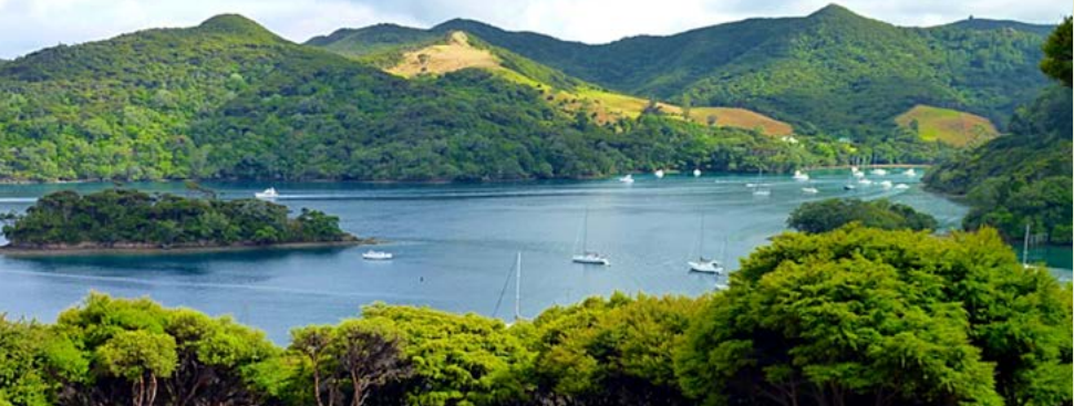
Kauri is making a comeback after extensive logging.